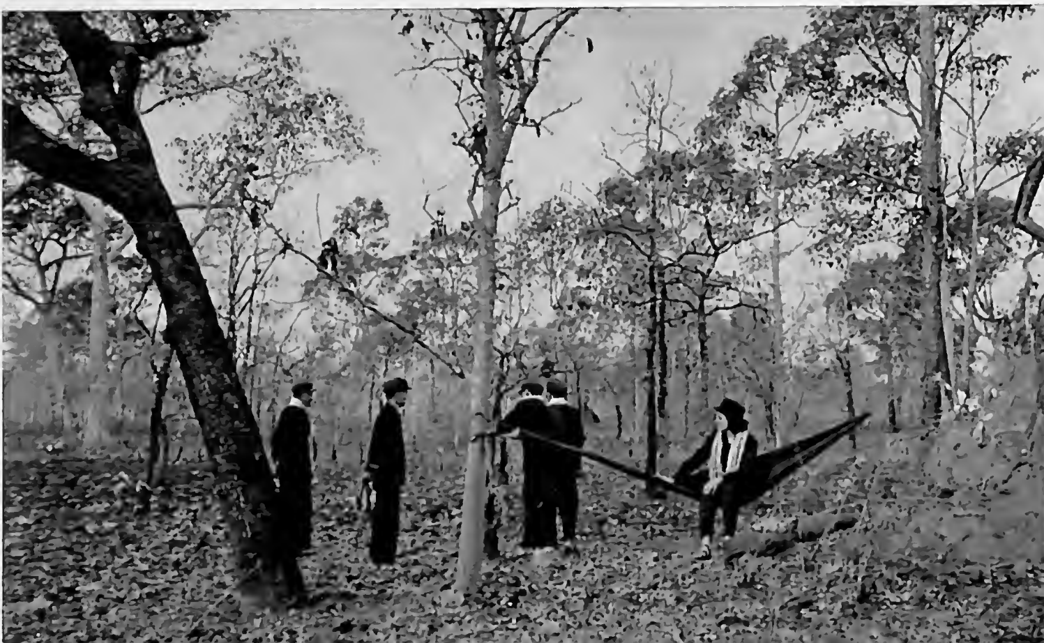
Slinging a hammock for Madame Sihanouk on the journey.